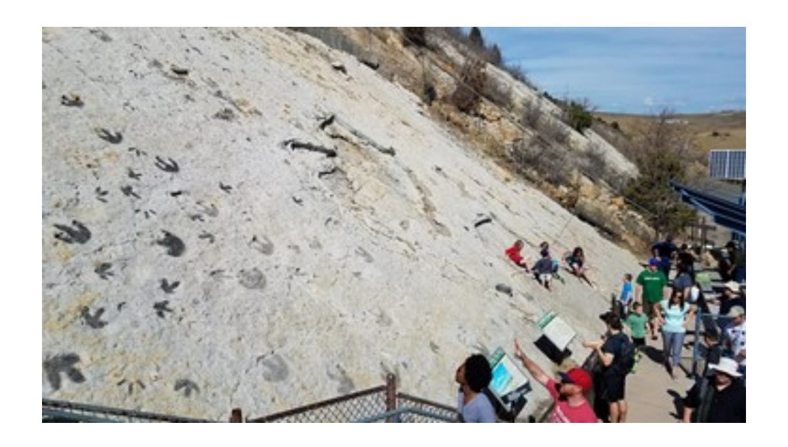
The dinosaur tracks at Dinosaur Ridge

The site is now home to Dinosaur Ridge, a National Natural Landmark, that includes a visitors center and two trails where visitors can see geologic sites, dinosaur bones, trace fossils and a pristine site of dinosaur tracks.