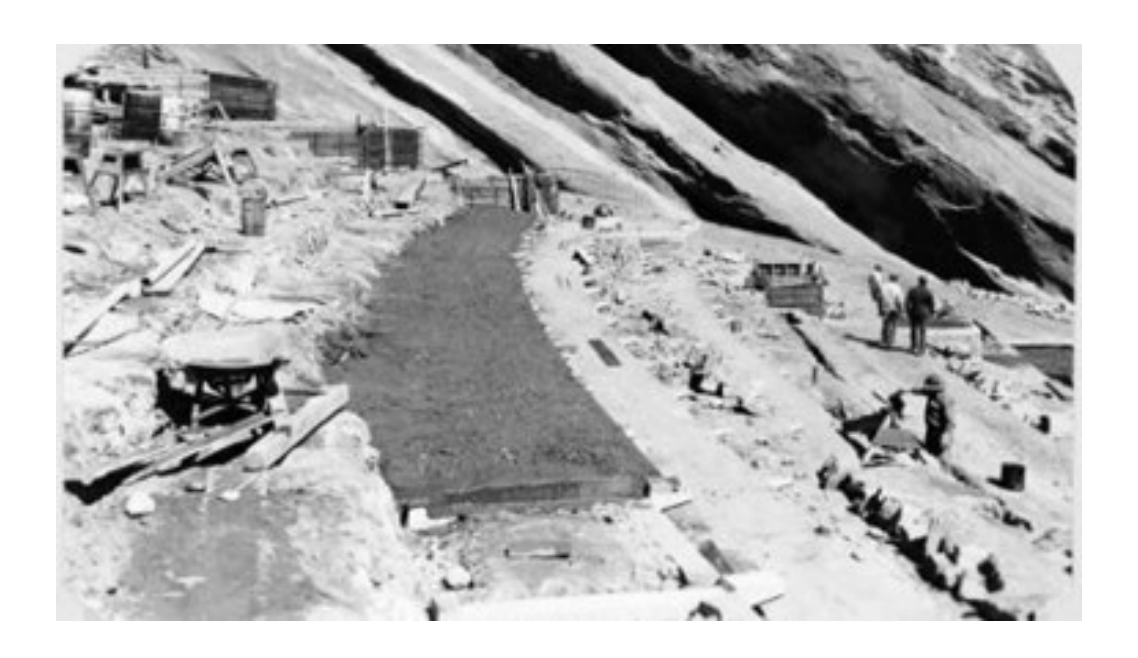
Civilian Conservation Corps workers building seating at Red Rocks Park Amphitheater c1937/1938