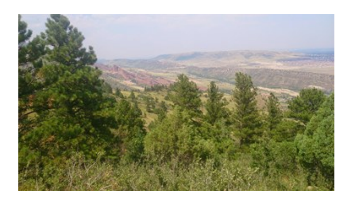
Mt. Falcon Park in Morrison

Bear Creek Avenue eventually turns into the windy and visually stunning Bear Creek Road (CO-74), along which are several trailheads, such as Lair O' the Bear (an easy trail that passes right by the Dunafon Castle), Corwina, Little Park, O'Fallon Park and more. The trails' close proximity to Denver and the western suburbs make them a popular day trip choice for families.