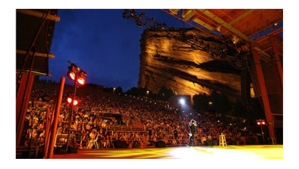
Red Rock Amphitheater

Red Rocks Park received National Historic Landmark status in 2015 and remains one of the most popular music venues in the country, both for performers and spectators. Thrillist also named the amphitheater among the 15 most beautiful music venues in the world.