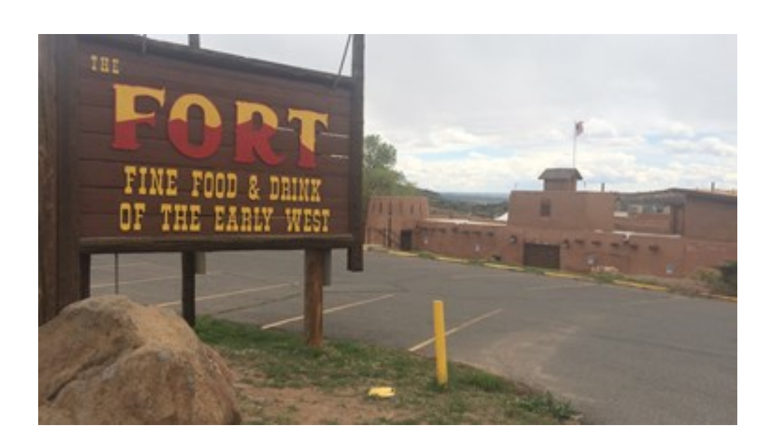
The Fort in Morrison

Among its many eating options is The Fort, a pioneer in putting unique spins on traditional Old West foods. Located at 19192 CO-8, The Fort is modeled after Bent's Old Fort, an 1833-49 trading post outside of what is now La Junta. A trip to the restaurant is a trip back to the frontier days, and the creative and tasty (albeit pricey) culinary experience is not one patrons soon forget.