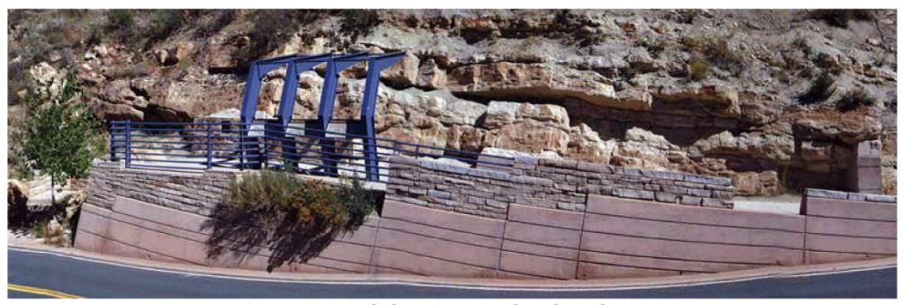
The bone site as seen from the road

The bones exposed today at our interpretive site are most likely from Stegosaurus and Apatosaurus and washed into this small braided stream channel deposit likely during a rainy season flooding event. Our Bone Quarry is one of only a few locations where you can see and touch dinosaur bones in the rock where they fossilized long ago.