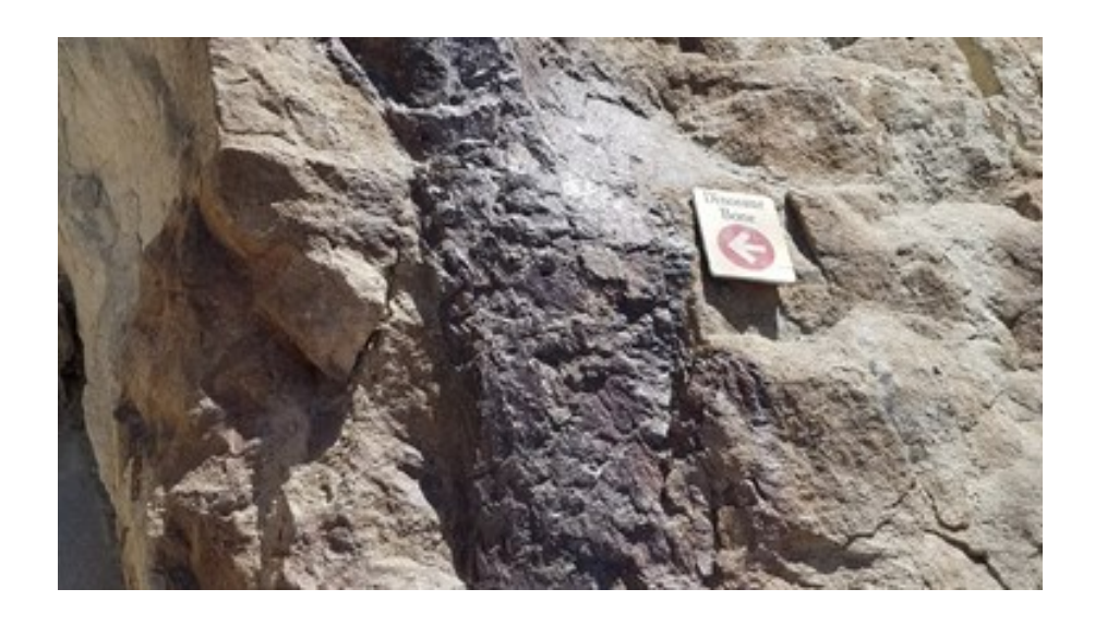
Bone at Dinosaur Ridge

The history of Morrison begins with the discovery of dinosaurs.