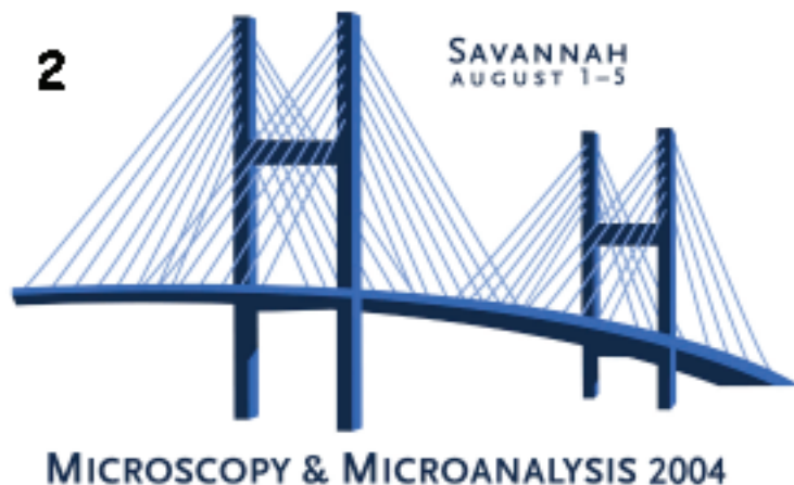
FIG. 2. Second sample figure for proceedings paper: the M&M 2004 logo. Note that figures will be reproduced in full color on the CD-ROM, but as grayscale images in the hardbound volume.